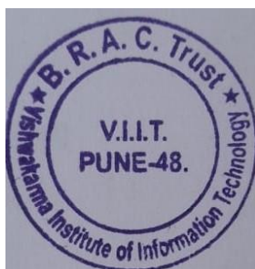
Director VIIT, Pune